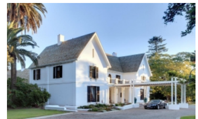
TABLE BAY HOTEL

Blanco House, the 150 year-old original Manor House and National Monument set on the 613 hectare Fancourt Estate was meticulously remodelled to create a boutique hotel that offers old-world, new-world and out of this world beauty and elegance. The Manor House offers a unique combination of classic opulence and the indulgent sophistication of a 21st century boutique hotel.