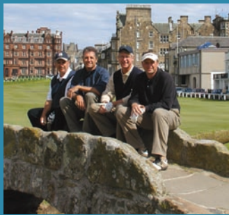
OLD COURSE ST. ANDREWS